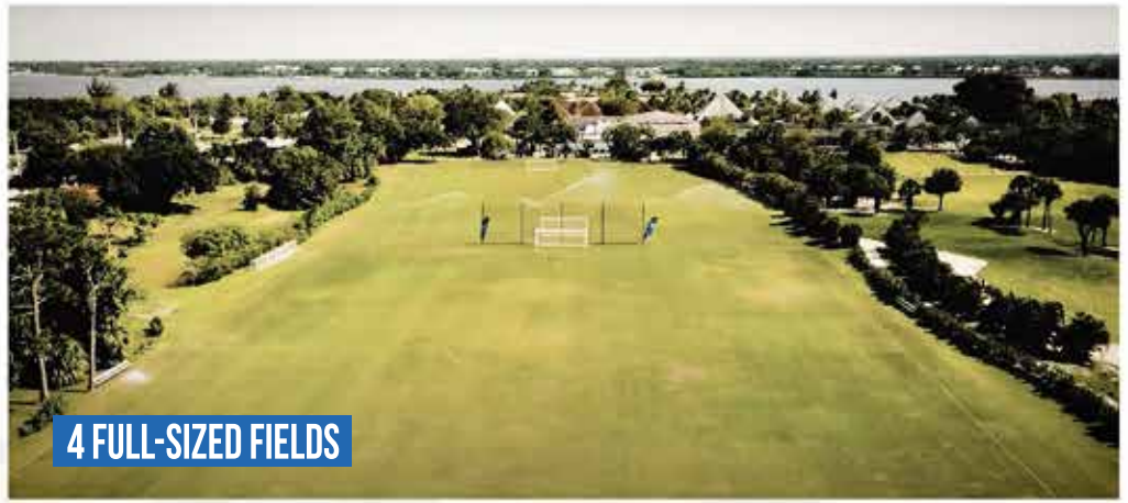
4 FULL-SIZED FIELDS